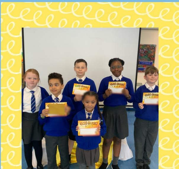
Gold Award Winners