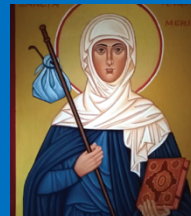
St. Angela Merici