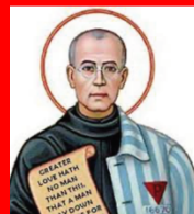
St Maximillian Kolbe