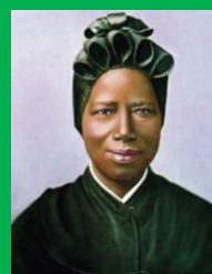
St Josephine Bakhita